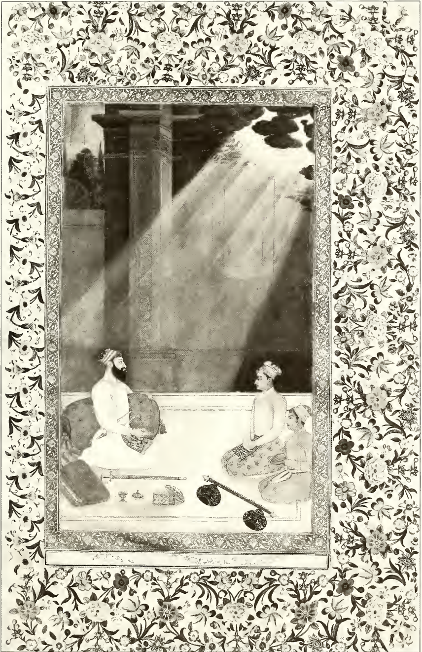
Figure 29. Emperor Aurangzeb in a Shaft of Light , attributable to Hunhar (act. 2d half 17th century). India, Mughal period, Aurangzeb period, ca. 1660. Opaque watercolor and gold on paper, 47.2 x 32.2. Smithsonian Institution, Freer Gallery of Art, Purchase, F1996.1a